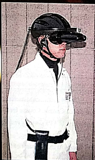
This technician wears a PestScan (moisture, methane and thermal optical-detection system) helmet.