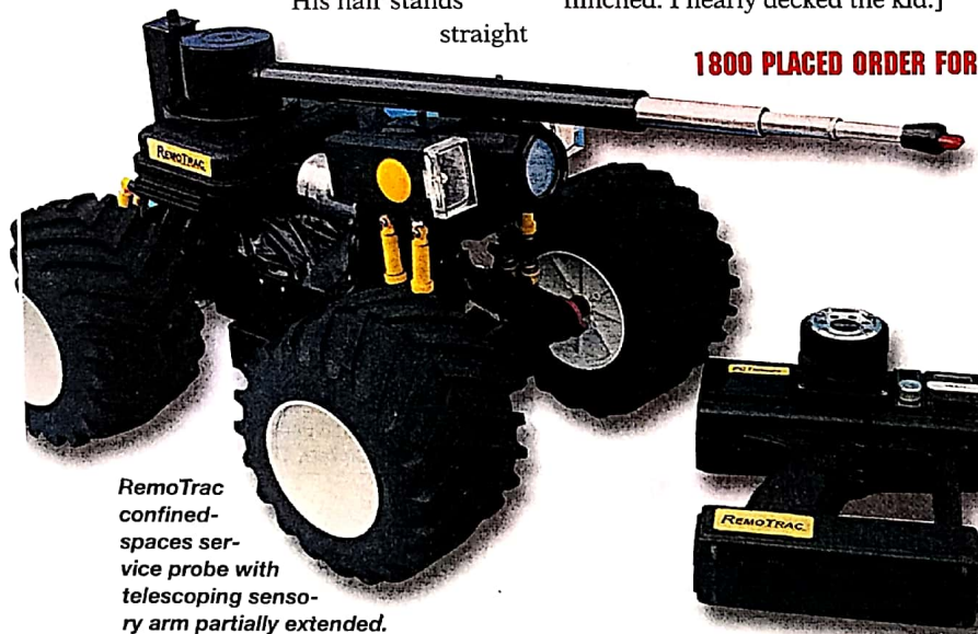
RemoTrac confined-spaces service probe with telescoping sensory arm partially extended.

MATERIALS — 1. One case of Blattastat cockroach respiratory blocking agent.